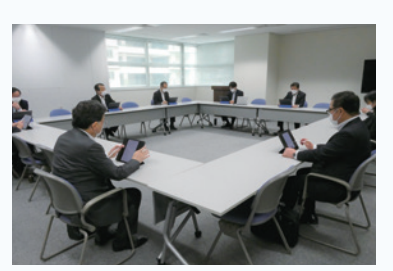
Paperless meeting (Board of Directors)

To reduce waste in our business operations, we have undertaken initiatives such as launching our "Business Efficiency Project", making our meetings paperless, using e-applications and teleconferencing (remote working), and building a new group portal. This means that large amounts of time previously taken up by inefficient tasks and travel can now be allocated to new tasks, and this also helps to improve conditions and margins for employees, such as reduced overtime and improved rates of paid leave being taken. In the future, as we use technologies such as DX tools and RPA, we will look for ways to further push the boundaries and expand existing business reforms into previously problematic workplaces, redoubling our efforts to achieve more diverse work styles.