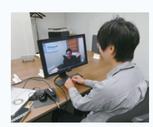
Information exchange in the global hay